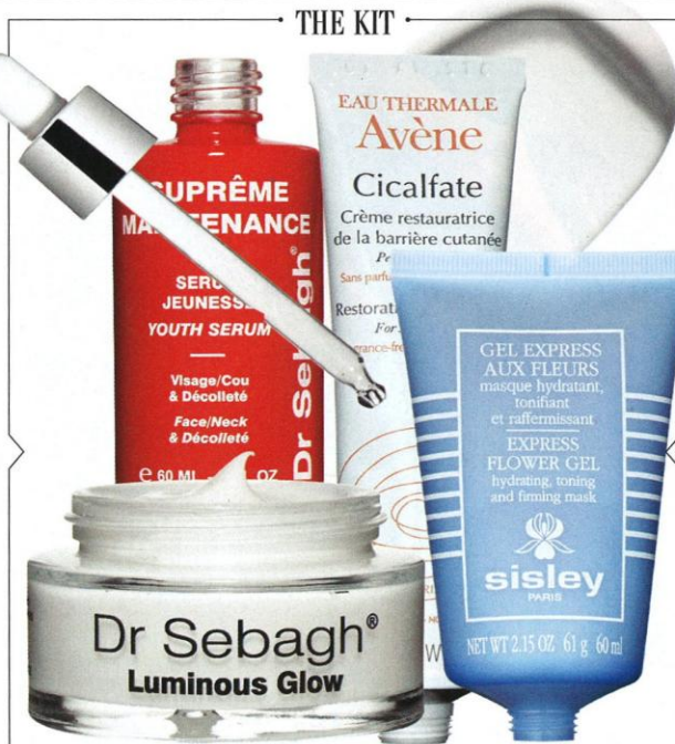
Clockwise from left: Effective on its own, DR SEBAGH Suprême Maintenance Youth Serum also plays well with other products for an extra anti-aging boost; AVÈNE Cicalfate Restorative Skin Cream “is a miracle—it will heal anything from sunburn to sensitivity to spots”; SISLEY Express Flower Gel “is extremely firming and fast—it only takes three minutes”; DR SEBAGH Luminous Glow imparts instant luminosity.